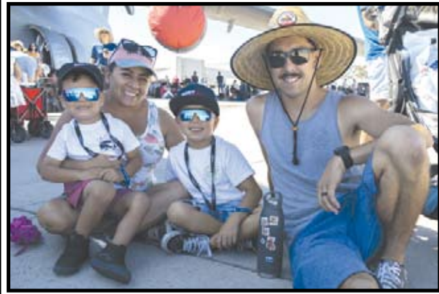
MCAS MIRAMAR (Sept, 25, 2022) - Air show spectators during the Miramar Air Show.