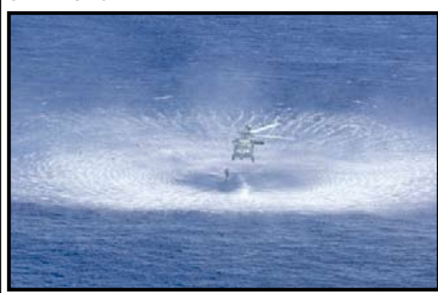
PHILIPPINE SEA (Sept. 22, 2022) - With USS Tripoli nearby, a Naval air crewman jumps from Sea Hawk helicopter assigned to Helicopter Sea Combat Squadron 23 during a search and rescue swimmer training evolution.