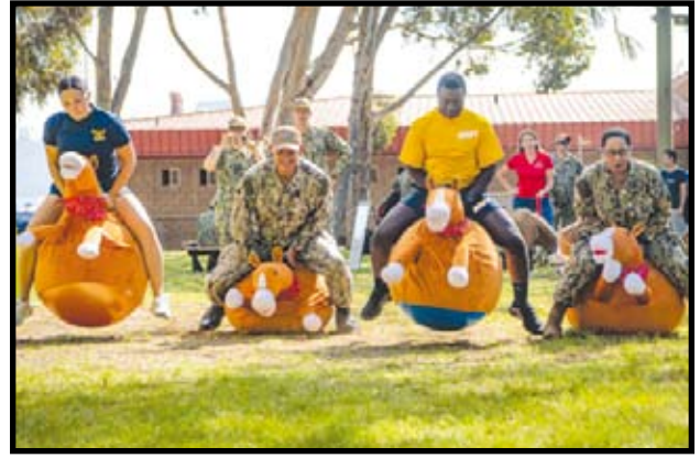
NAS North Island (Sept. 16, 2022) - Sailors attached to Carl Vinson aircraft carrier race during a Mental Health Wellness Fair here. Vinson is pierside in its homeport.