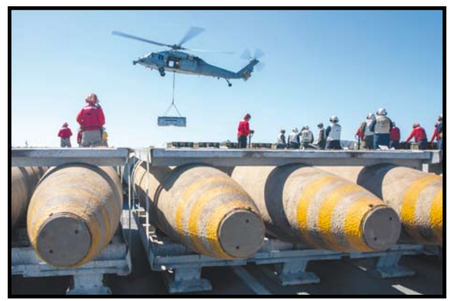
MAKIN ISLAND, at sea (Sept. 15, 2022) - Sea Hawk helicopter assigned to Helicopter Sea Combat Squadron 21 drops off ordinance on the amphibious assault ship.