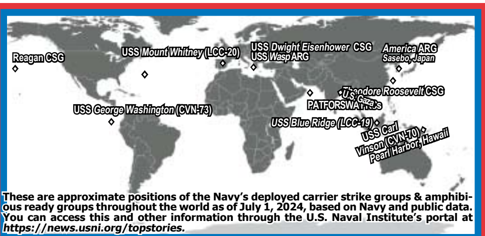
These are approximate positions of the Navy's deployed carrier strike groups & amphibious ready groups throughout the world as of July 1, 2024, based on Navy and public data. You can access this and other information through the U.S. Naval Institute's portal at https://news.usni.org/topstories .