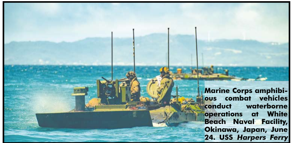
Marine Corps amphibious combat vehicles conduct waterborne operations at White Beach Naval Facility, Okinawa, Japan, June 24. USS Harpers Ferry and embarked elements of the 15th MEU are conducting routine operations in the U.S. 7th Fleet.