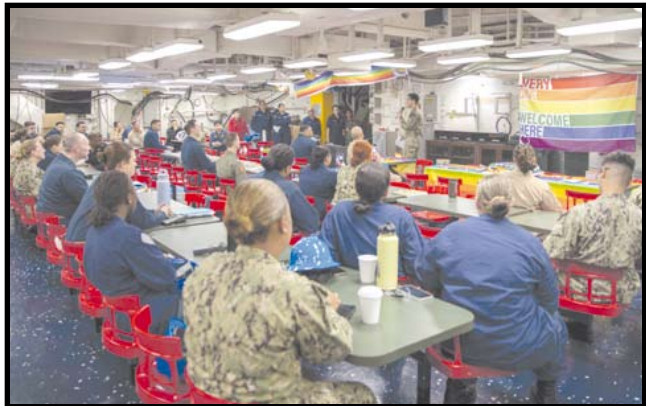
RAINBOW MAKIN Sailors attend a LGBTQ+ observance on the mess decks of amphibious assault ship USS Makin Island (LHD 8), June 25, 2024. Makin Island is a Wasp-class amphibious assault ship currently homeported in San Diego.