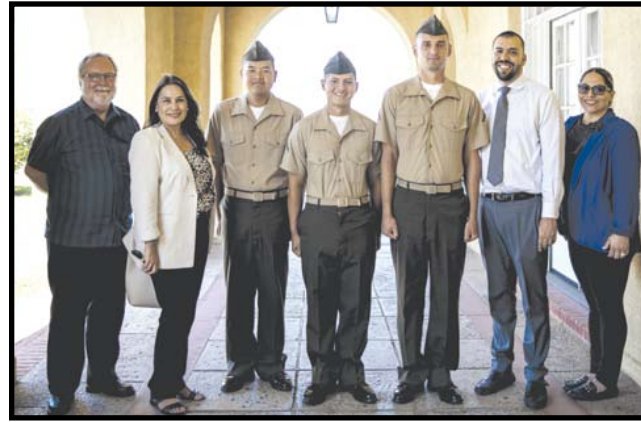
Marines with Echo Company pose with their sponsors after a naturalization ceremony at MCRD, San Diego, June 27. The naturalization ceremony took place during family day to recognize Marines who became U.S. citizens by completing bootcamp.