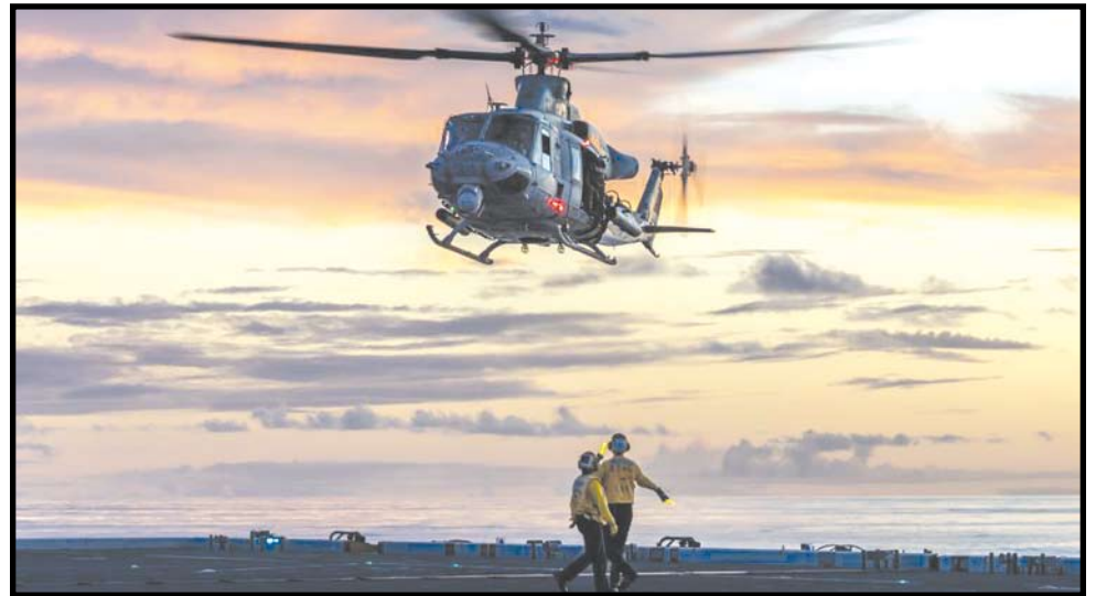
A Marine Corps UH-1Y Venom prepares to land aboard expeditionary sea base USS Miguel Keith in the Philippine Sea on Sept. 28, 2024.

“When we say ‘expeditionary,’ part of that means being able to react quickly and get to places quickly,” Harper said. “The other aspect is being able to distribute not just for a short amount of time, but for a sustained amount of time. And so, using these newer or different forms of ships to move Marine forces and support Marine