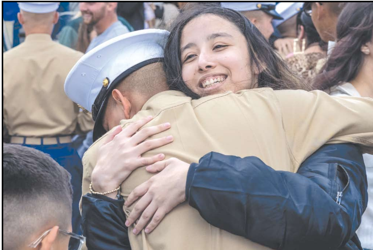
RECRUIT HUG A Marine with Mike Company, 3rd Recruit Training Battalion, is greeted by his guest following his graduation ceremony at Marine Corps Recruit Depot San Diego on Nov. 15, 2024. Graduation took place at the completion of the 13-week transformation, which included training for drill, marksmanship, basic combat skills, and Marine Corps customs and traditions.