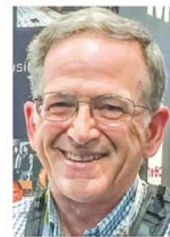
by Jan Wagner

to further attract visitors. Exhibits tend to be modest, mostly limited to a representative selection of new vehicles grouped together by auto manufacturers and displayed, with signage, on carpeting inside convention centers' exhibit halls.