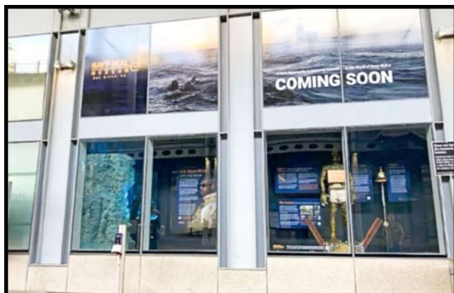
The future Navy SEAL Museum of San Diego.

It is also the future home of a UC San Diego arts space.