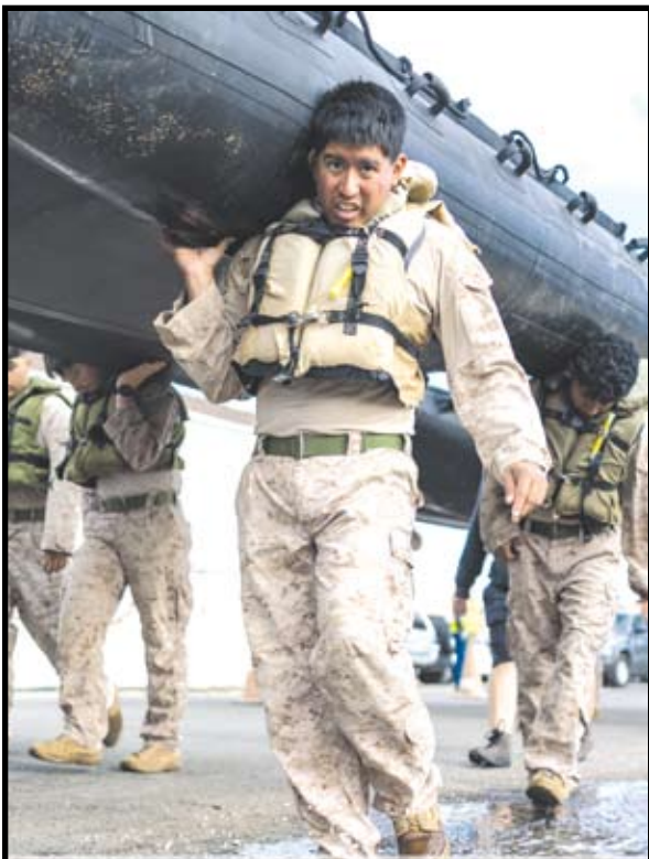
CORONADO (Nov. 18, 2024) A Marine with Bravo Company, 1st Battalion, 7th Marine Regiment, 1st Marine Division, carries a combat rubber-raiding craft during an infantry company small boat raid course hosted by Expeditionary Warfare Training Group Pacific at the Naval Amphibious Base here.