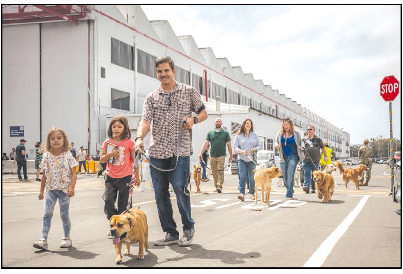
BRING YOUR DOG TO WORK DAY Naval Information Warfare Systems Command (NAVWAR) celebrates Bring Your Dog to Work Day with a dog parade June 19, 2025. The celebration consisted of a costume contest, parade, hot dog cook out, and is apart of NAVWAR's ongoing Wellness Initiative.