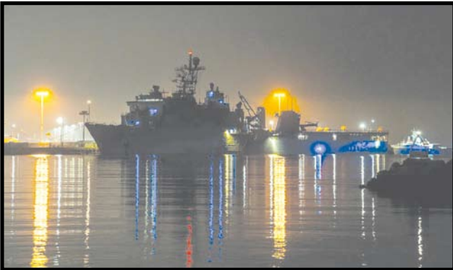
LOS ANGELES (May 26, 2025) San Diego-based USS Harpers Ferry prepares to depart Los Angeles at the conclusion of Fleet Week. Los Angeles Fleet Week is a sea service celebration that allows residents to witness today's maritime capabilities firsthand.