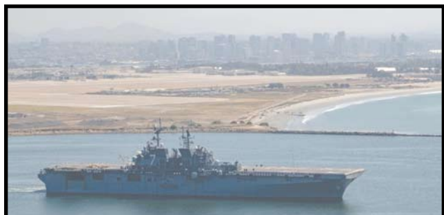
USS Tripoli, shown here transiting San Diego Bay, May 19, on the way to its new homeport.