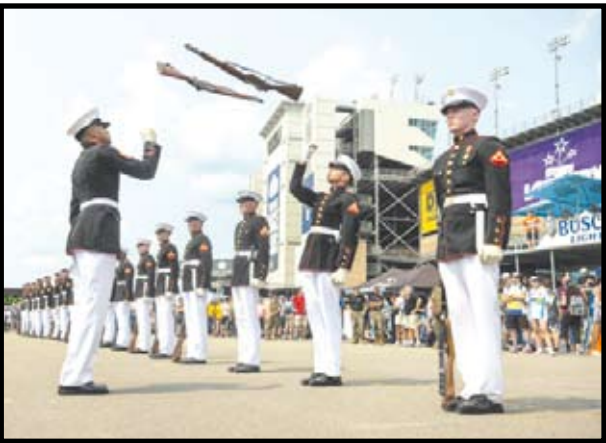
RIFLES UP Marines assigned to the Marine Corps Silent Drill Platoon perform a double inspection sequence at the Cracker Barrel 400 at Nashville Superspeedway in Tennessee, June 1, 2025, during Marine Week Nashville 2025. The week celebrates the Marine Corps 250th birthday.

“So if there’s a problem, we don’t have any other place to land. If there is an issue on the field where as if we had an area to conduct FCLPs much closer to land, it would provide much bigger safety margins for us to operate and train.”