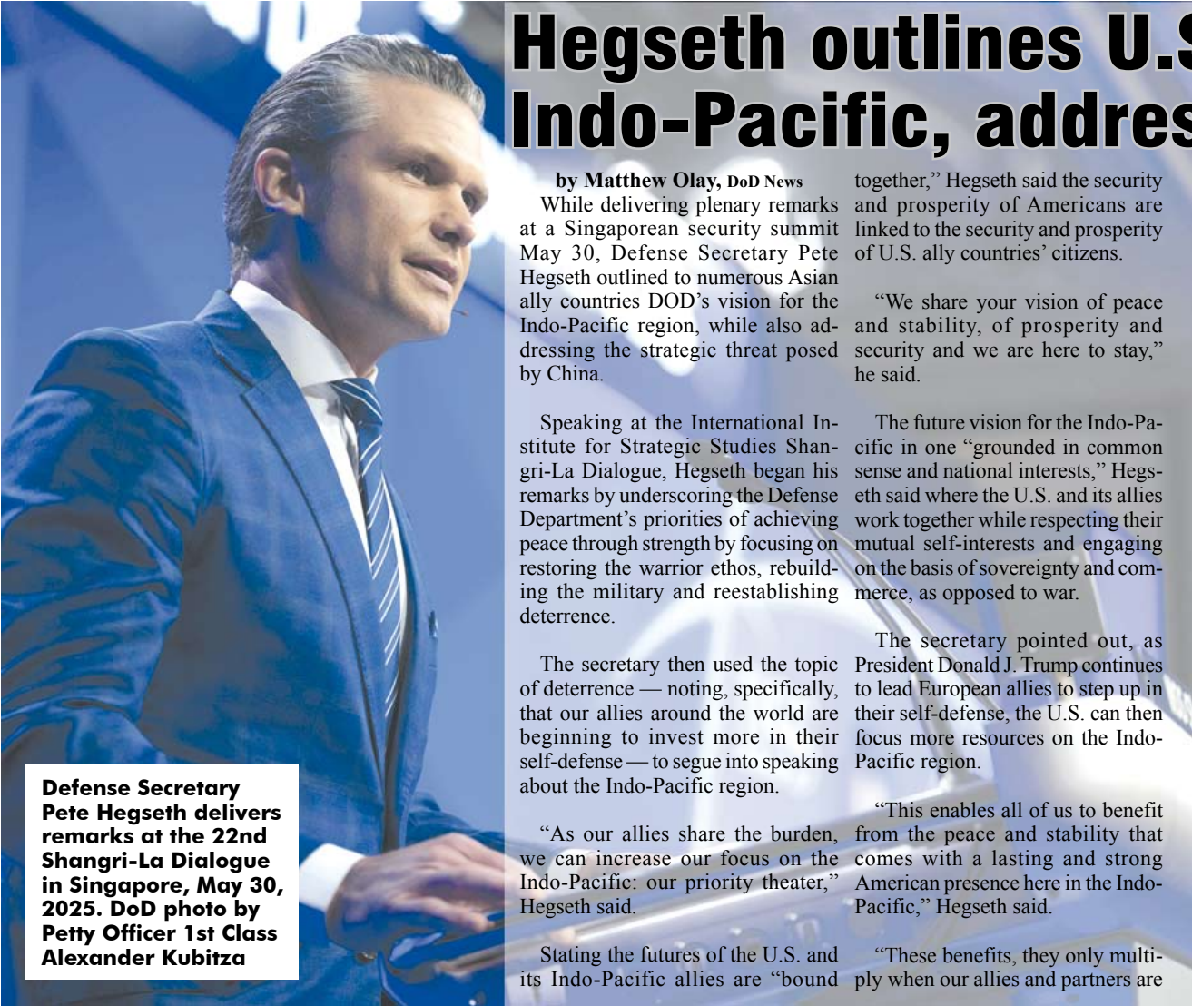
Defense Secretary Pete Hegseth delivers remarks at the 22nd Shangri-La Dialogue in Singapore, May 30, 2025.