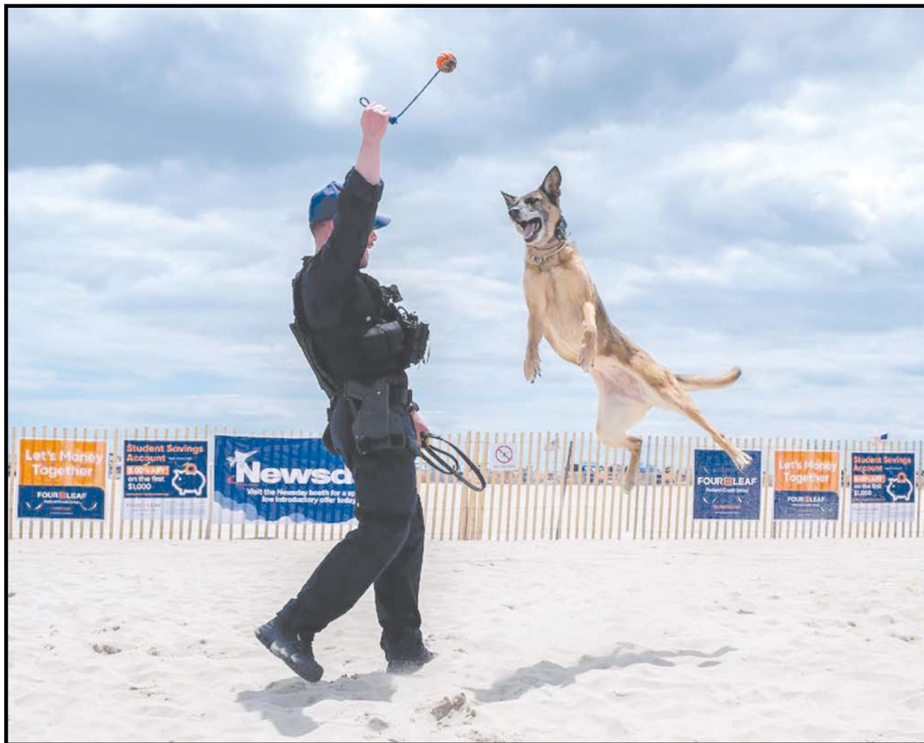
SUPER DOG Coast Guard K9 Ani plays with her handler at Jones Beach State Park, N.Y., during the Four-Leaf Air Show, May 25, 2025.