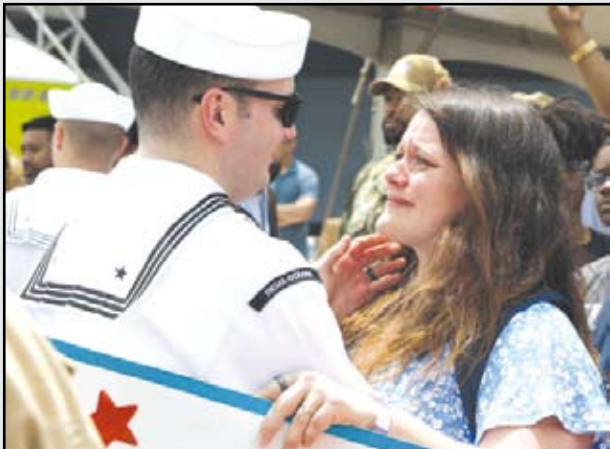
A Sailor with aircraft carrier Harry S. Truman gets an emotional welcome following an eight-month deployment.