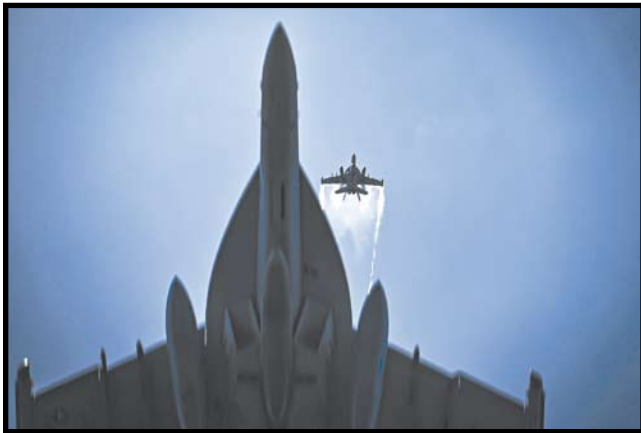
USS NIMITZ, at sea (May 27, 2025) E/A-18G Growlers from the "Cougars" of Electronic Attack Squadron (VAQ) 139 fly near aircraft carrier USS Nimitz (CVN 68) in the South China Sea. Nimitz is underway in the U.S. 7th Fleet area of operations on a scheduled deployment, demonstrating the U.S. Navy's unwavering commitment to a free and open Indo-Pacific.