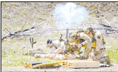
Marines fire a M224A1 mortar system during a training event at Camp Guernsey Joint Training Center, Wyo., April 9, 2025.

when you take that assessment," she said. "It'll also flag it and say, something looks off ... that it's not in alignment with the norms now. A retake or clinical evaluation